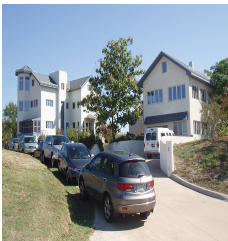
MAP FROM DALLAS ON OTHER PAGE